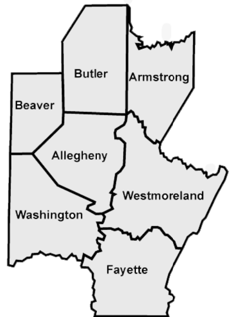
Figure 1. Counties of the Pittsburgh Metropolitan Statistical Area

Presented in this report is employment data by race, occupation and gender compiled by the place of work for individual workers at the time of the 2000 Census. This differs from employment data compiled by place of residence due to commuting patterns. The full EEO Special Tabulation includes separate compilations of employment data compiled by place of residence for most regions of the country. Employment compiled by place of residence for workers in the Pittsburgh Metro SA is one of seven regional datasets excluded from the EEO Special Tabulation because of confidentiality restrictions.